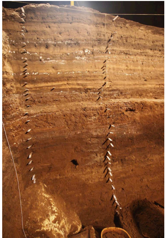
Deep, layered fossil deposits in Blanche Cave, Naracoorte. Each layer represents a window in time. The tags mark individual layers.

Larger species fell victim to concealed cave entrances that acted as pitfall traps for the unwary. Kangaroos were particularly susceptible to entrapment, being fast-moving and active at