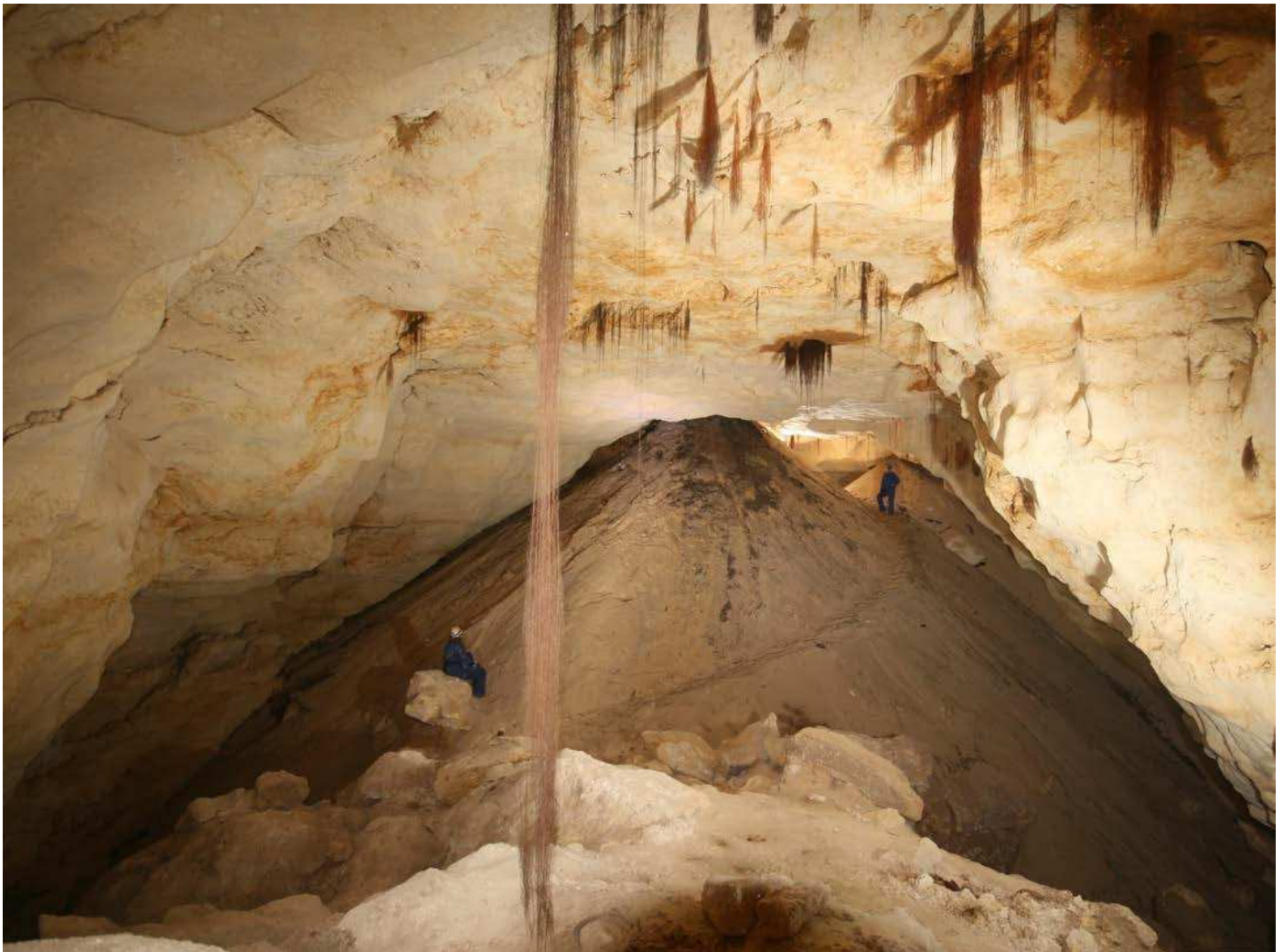
Enormous sand cones in Sand Cave, Naracoorte. Two people in overalls show the scale of the area.