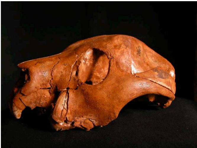
Fossilised skull from Thylacoleo - a carnivorous marsupial that lived in Australia around 50,000 - 1.5 million years ago.

The reign of these amazing animals came to an end around 45,000 years ago, with the precise cause for their extinction still a hot topic for debate.