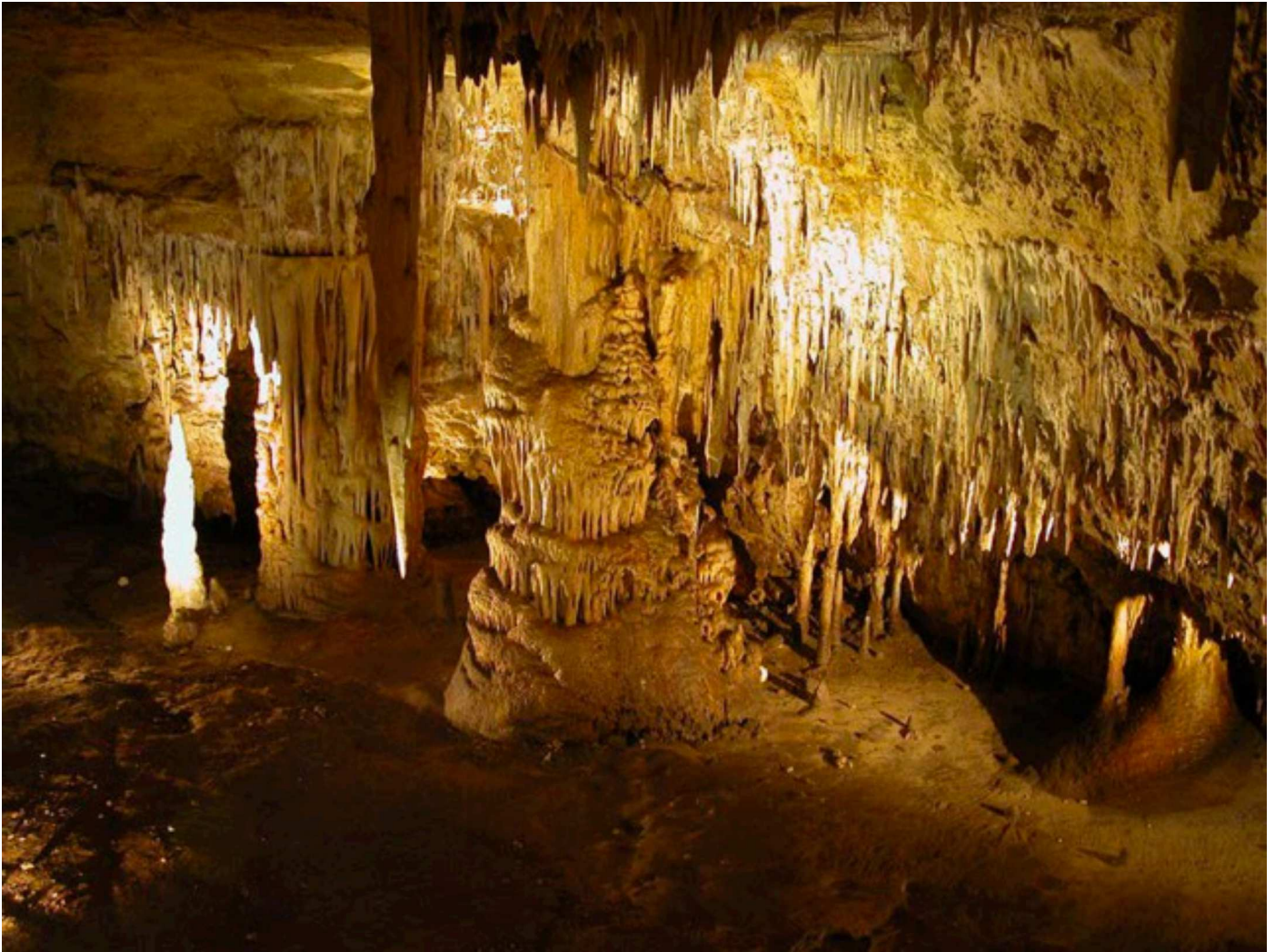
Alexandra Cave, Naracoorte Caves National Park.