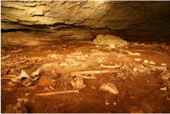
Pitfall megafauna fossil assemblage in the Upper Ossuary, Victoria Fossil Cave, Naracoorte.

Scattered across the red sediment floor of a vast chamber were countless skulls and jaws of Australia's lost giants, the megafauna.