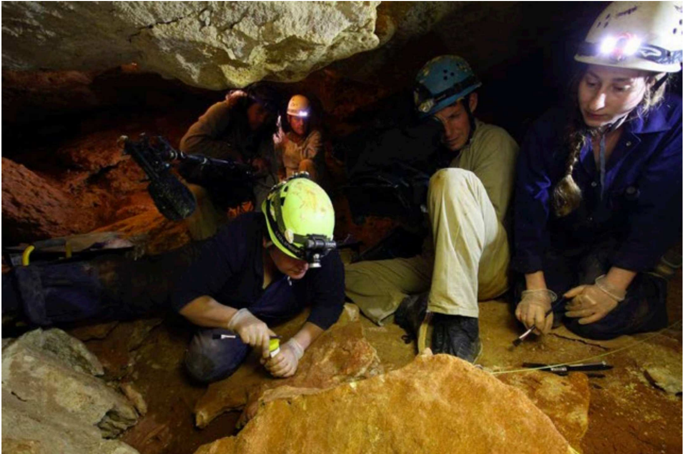
It's a little bit squeezey in here. A film crew working with researchers at Naracoorte Caves.

night, dusk or dawn. Even the gigantic megafauna species succumbed to these traps.